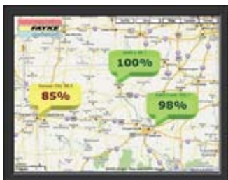
Multiple Site Interface

Harris offers a compact monitoring and control system for use with the ZX family of transmitters and other supporting equipment. The Web Remote system provides reliability and a small form factor due to a contemporary design that uses no moving parts. Simply mount the Web Remote card into the pre-wired slot in the ZX chassis, connect your equipment to the Internet or LAN, and you have complete monitoring and control capability in any location. Setup may be customized to allow for alarms once any set parameter violates a user-selectable threshold. A user-definable map page allows tracking of multiple ZX transmitters from one PC over a large geographical area.