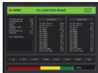
Web Interface Remote